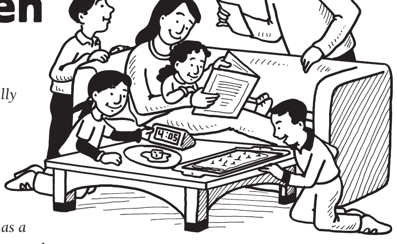
Editor's note: Guidelines are changing rapidly. Make sure to follow all local, state, and federal laws and recommendations on social distancing and other practices when using these ideas.

As a parent, you may feel overwhelmed and uncertain about what to do. Use this guide as a starting point for supporting your youngsters during the coronavirus crisis.